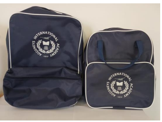
Junior and Senior School Bags

Branded school lunch bag (insulated inside)